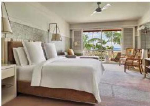
RELAX AT FOUR SEASONS RESORT NEVIS' REDESIGNED GREAT HOUSE (TOP LEFT) BEFORE RETREATING TO ONE OF THE WELL-APPOINTED SUITES (AS ABOVE) AND ENJOYING COASTAL CUISINE AT ESQUILINA (BELOW).