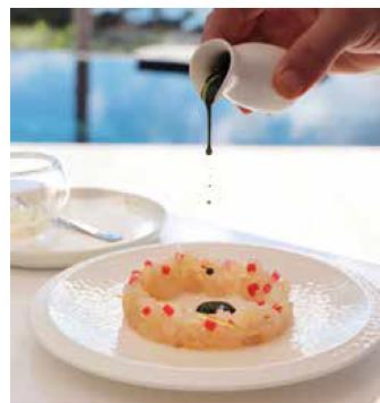
HOTEL LE TOINY, CLOCKWISE FROM TOP LEFT: THE ULTRA-PRIVATE LE TOINY BEACH; THE MOUNTAINS-MEETS-OCEAN VISTA FROM THE RESORT'S SCENIC POOL; THE SPIRIT SUITE POOL; FRESH-CAUGHT MAHI MAHI CEVICHE AT JARAD; THE SPIRIT DUPLEX SUITE.

Another favorite back on the haute hotel scene is Le Sereno Saint Barthélemy, which has reopened its all-suite enclave on Grand Cul de Sac Beach with a look similar to its pre-hurricane incarnation. The minimalism of French designer