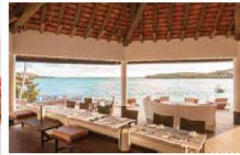
LE SERENO, FROM LEFT: THE GRANDE SUITE PLAGE; PARMIGIANA DI MELANZANE; WATERFRONT VIEWS AT AL MARE RESTAURANT.