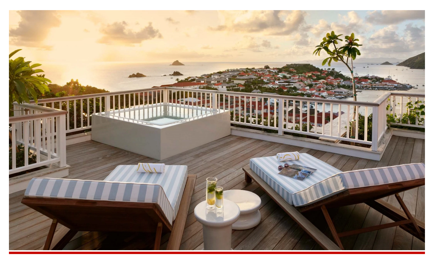
Spot celebrities from your private deck at Hôtel Barrière Le Carl Gustaf on St. Barts. Le Carl Gustaf