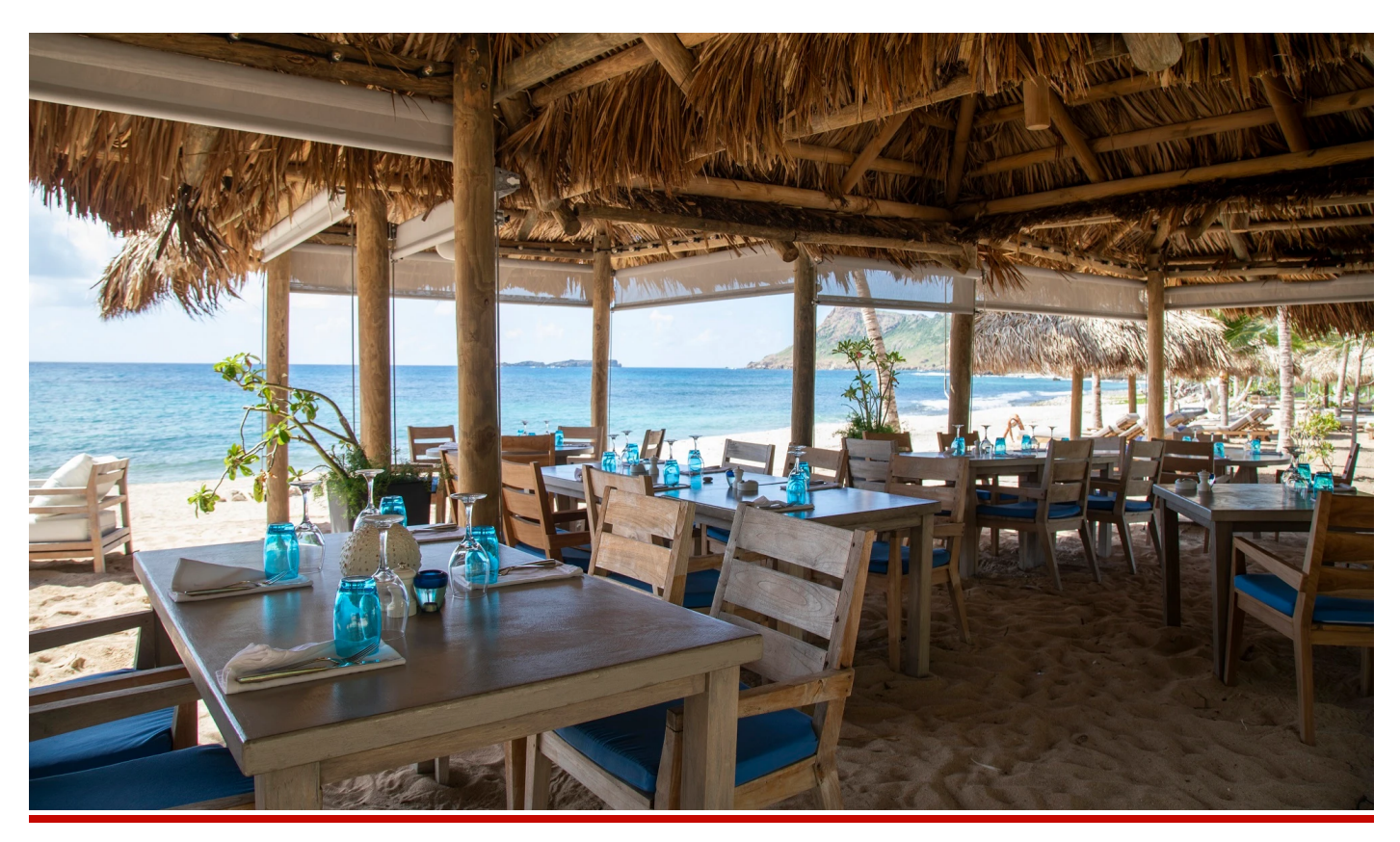
Enjoy romantic barefoot dining on the beach at Hotel Le Toiny. Hotel Le Toiny