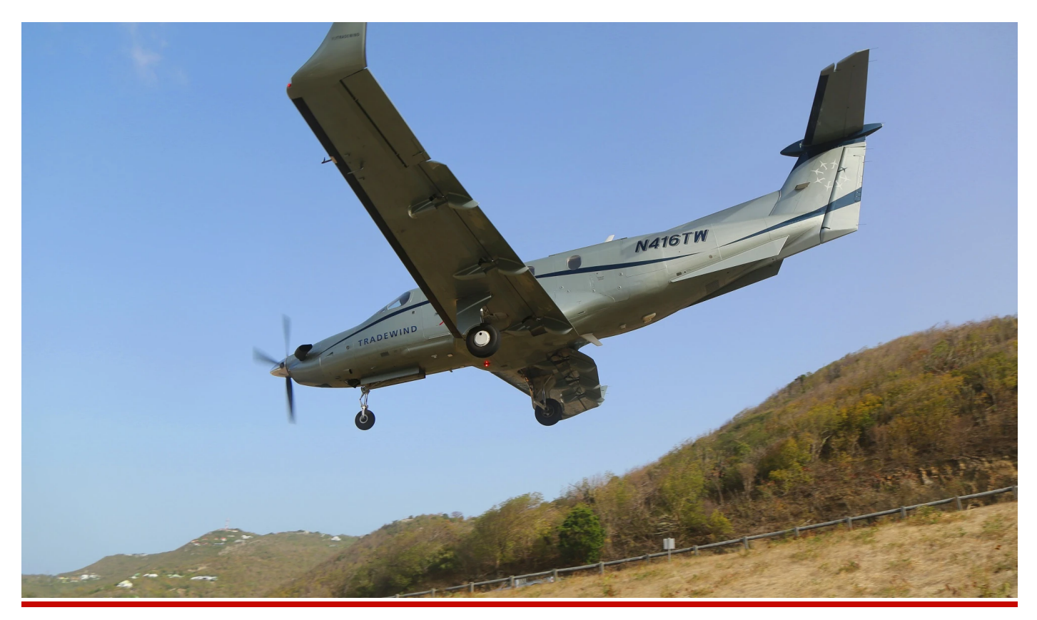
Watching small planes land and takeoff on St. Barts' itty-bitty runway is quite the spectator sport.

So where does that leave meager mortals who want a taste of French Caribbean magnificence? Hotels. And damn good ones.