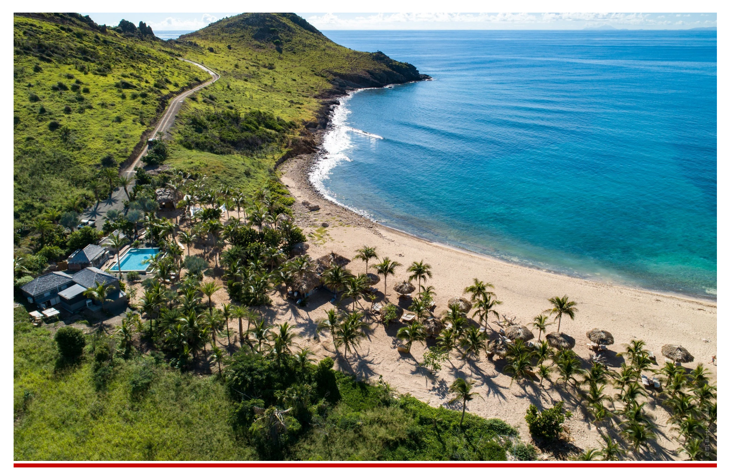
Toiny Bay is the resort's namesake, which it overlooks. Hotel Le Toiny

In December, Le Toiny upped their gambit with a brand-new and even larger, "villa over the ocean" — a new 7,000-square-foot, four-bedroom villa with a 900-square-foot pool and tropical garden. February rates start at $2,248 per night.