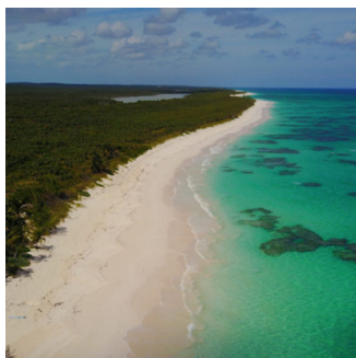
( https://www.caribjournal.com/2020/03/16/bahamas-beaches-best-25-visit/ )