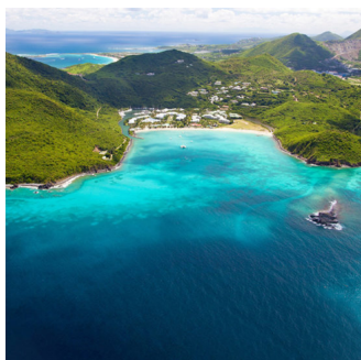
( https://www.caribjournal.com/2020/03/05/secrets-opens-new-all-inclusive-in-st-martin/ )